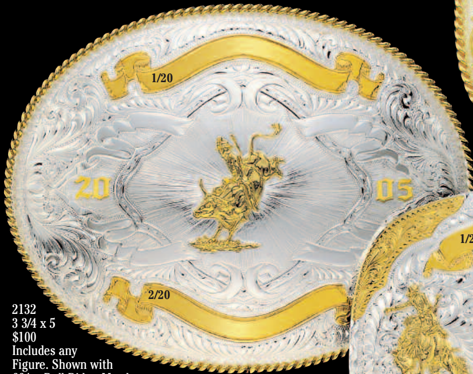
2132 3 3/4 x 5 $100 Includes any Figure. Shown with 664 - Bull Rider. May be ordered with or without Date Trim (D77) at no extra charge.