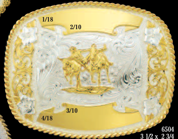
6504 3 1/2 x 2 3/4 $90 Any Figure. Shown with 652 - Steer Wrestler.