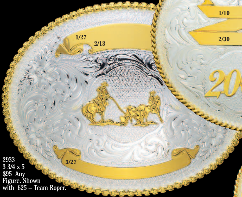
2933 3 3/4 x 5 $95 Any Figure. Shown with 625 - Team Roper.

Each ribbon is coded for your convenience. The first digit is the ribbon number and the second number shows how many characters and spaces will fit on the ribbon.