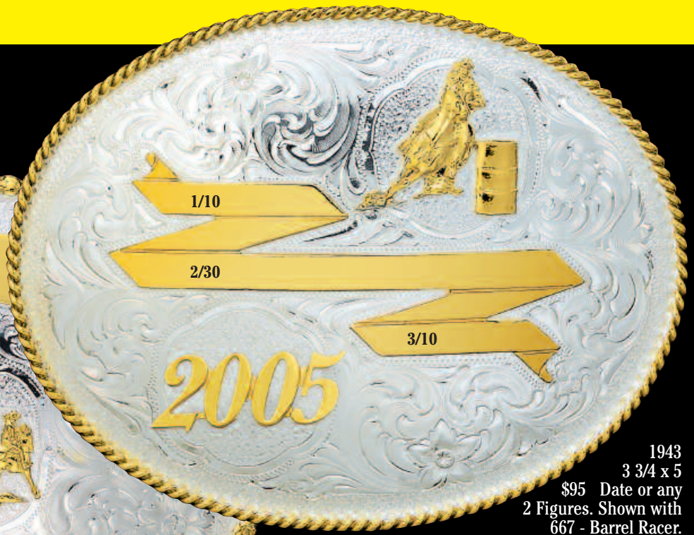
1943 3 3/4 x 5 $95 Date or any 2 Figures. Shown with 667 - Barrel Racer.